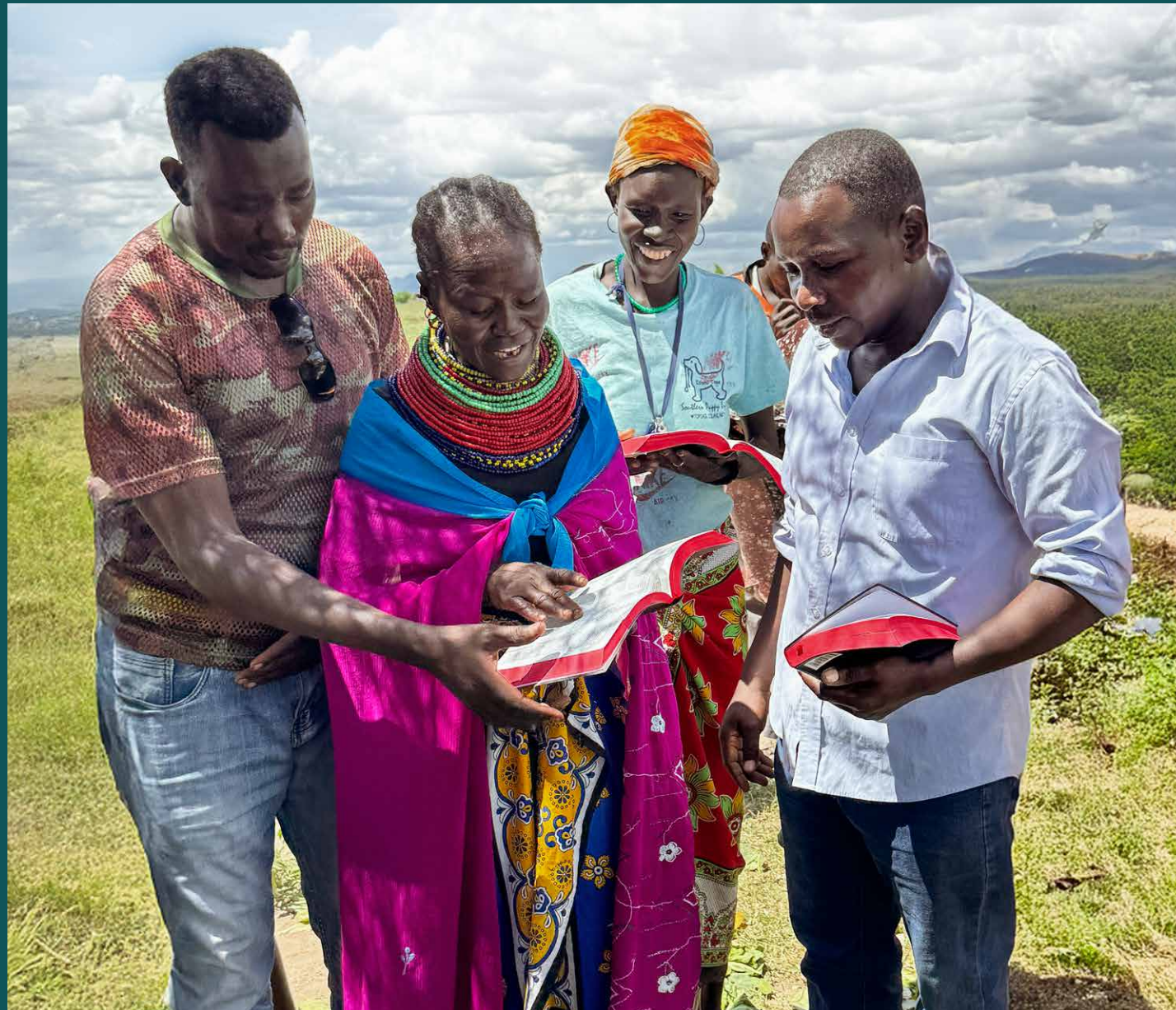
Kenyan missionaries distribute Bibles in native languages.