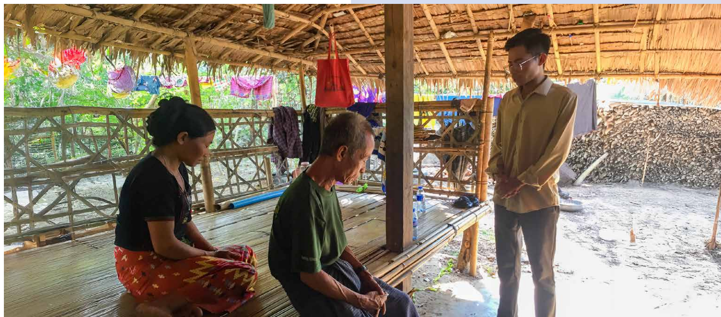
War victims in Myanmar receive aid and the hope of the gospel.

“During her most difficult period, we consistently provided emotional support and hope for her future. With our encouragement, she successfully transitioned careers and returned to her hometown to farm. She has settled into rural life and gradually adapted to the countryside. When our team visited her, she expressed joy at seeing us and repeatedly shared her regret for having taken the wrong path. Now, with her newfound faith, she faces the future filled with hope.”