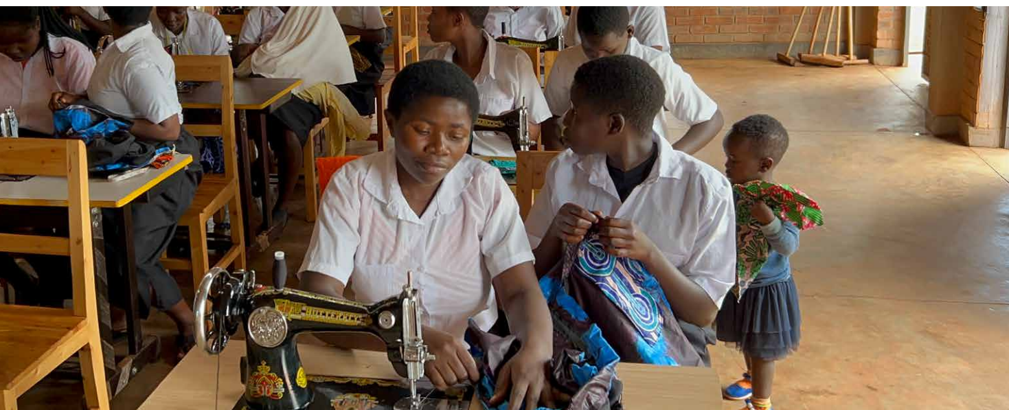
Indigenous missionaries in Rwanda are teaching teen mothers how to sew as they share Christ with them.

One Yemeni believer has posted hundreds of videos to various social media platforms. His network of teams follow up with seekers and new believers. Millions of views have resulted in thousands of interactions and hundreds of decisions for Christ. Those who accept Christ are delegated to a network of trusted people in various countries; several house churches were started by those new believers.