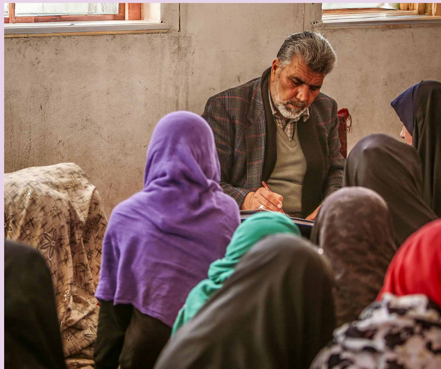
Afghans are responding to the gospel, despite great risk.

— Leader of Indigenous Ministry in Afghanistan