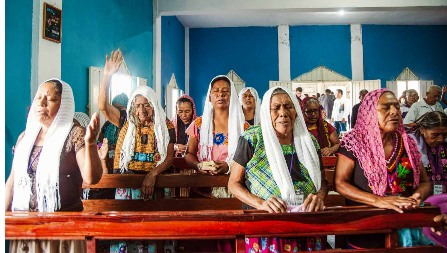
Believers among minority ethnic groups in Mexico at a Bible translation workshop.