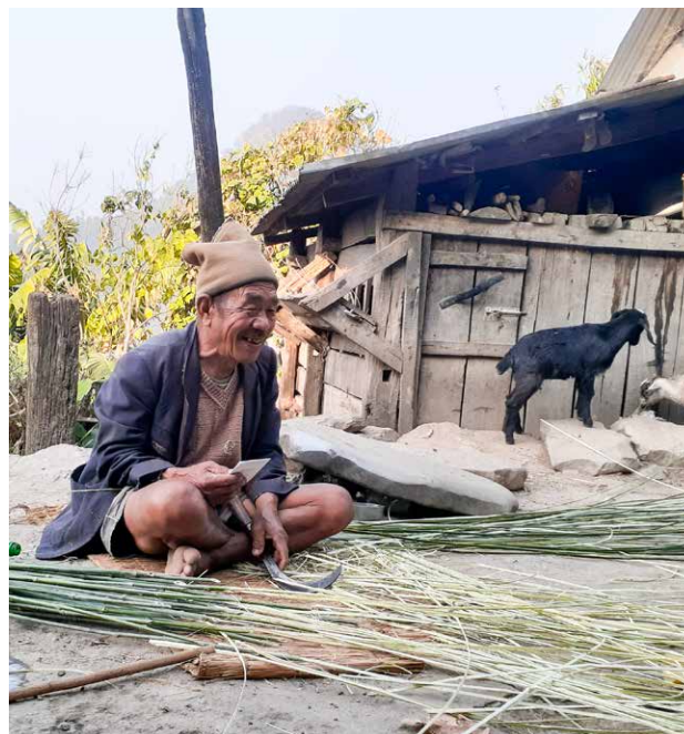
An elderly man smiles after receiving a gospel tract.