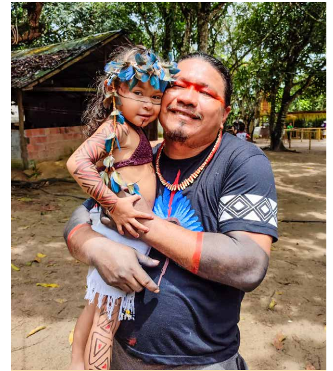
The gospel is reaching isolated tribes in the Amazon region.

Later, a worker with the same ministry visited a village inhabited by another unreached people group. He traveled for six days by river to reach them and was invited by the chief to bring the gospel to the village. “According to the chief, the people of the village need to know the love of God,” the ministry leader said. The missionary also delivered equipment to them for the manufacturing of cassava flour. “The villagers were overjoyed by the precious help,” the leader said. “In the days that our missionary stayed in the village, he had the opportunity to talk about the love of God to the families who received the Word of God with joy.”