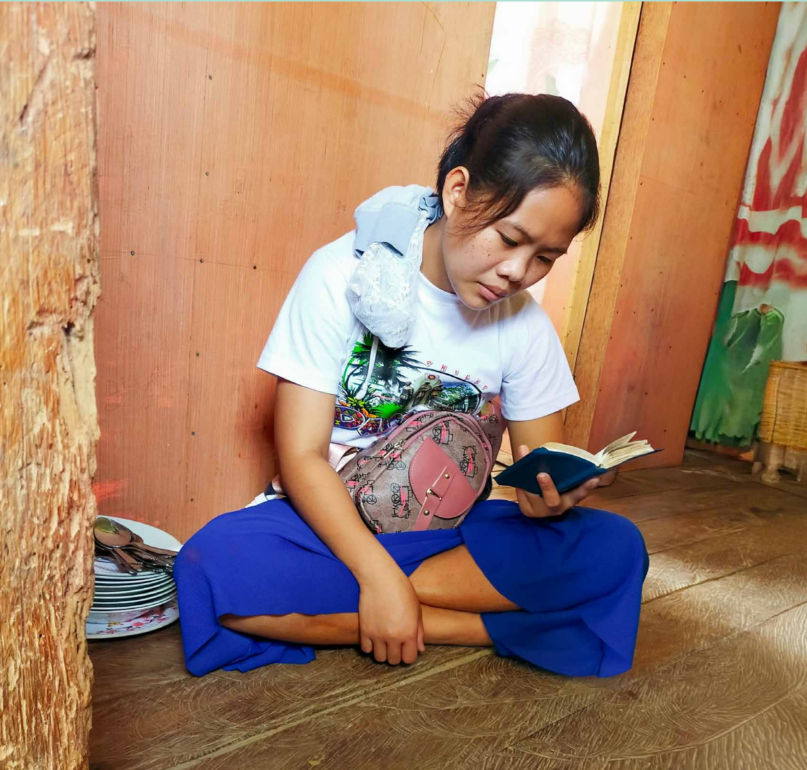
Member of an ethnic minority reads the Bible.

An unreached people group is a distinct ethnic group among which there is no indigenous community of believing Christians with adequate numbers and resources to evangelize their people group without outside assistance.