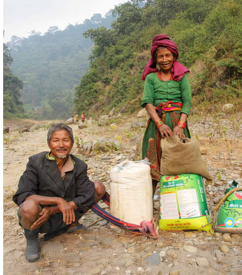
Indigenous missionaries provide practical aid to those whom they are evangelizing and discipling.