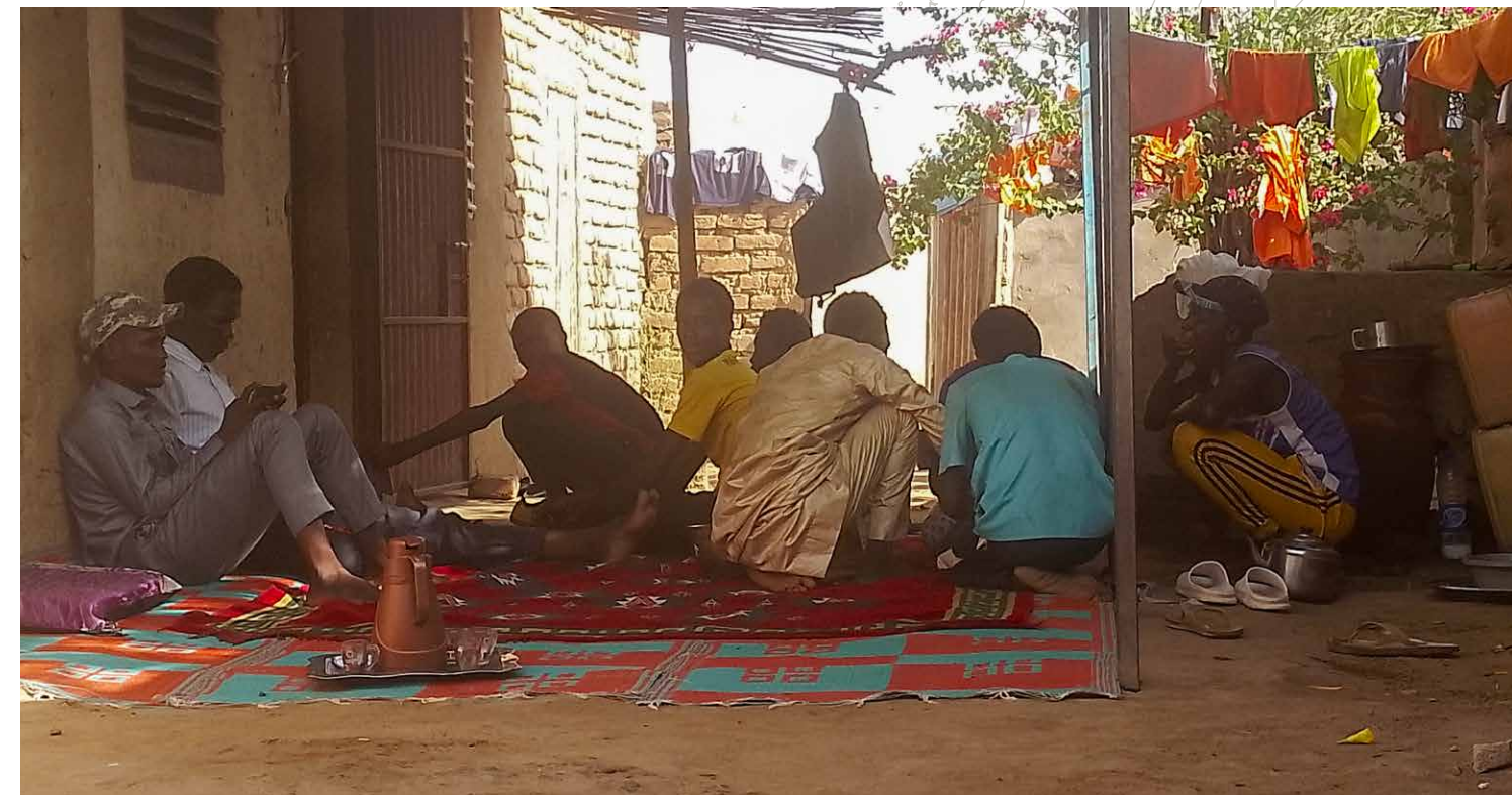
Maslam people gather for discipleship.