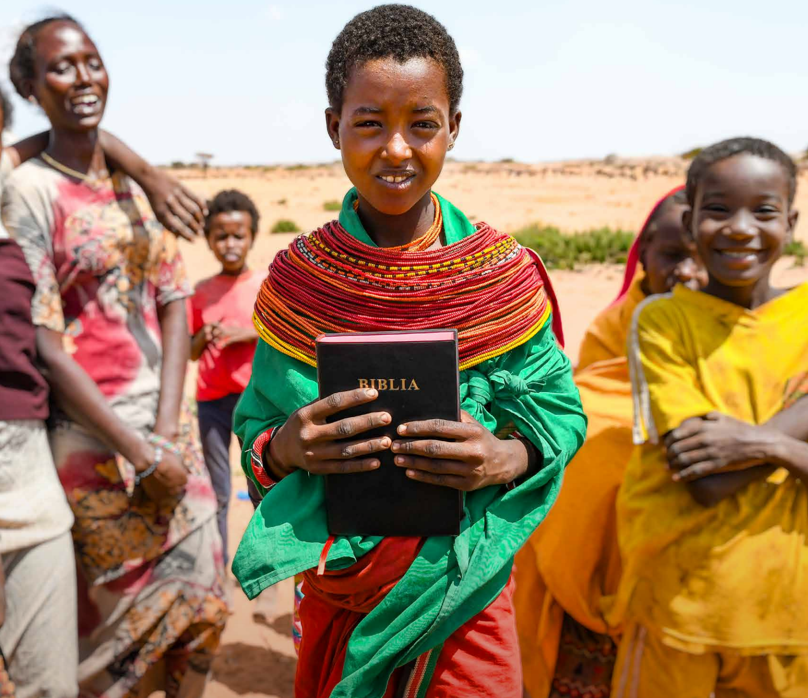
This young girl from a Kenyan tribe received a Bible to read to her village.

Fiscal Year 2025 (July 1, 2024 - June 30, 2025)