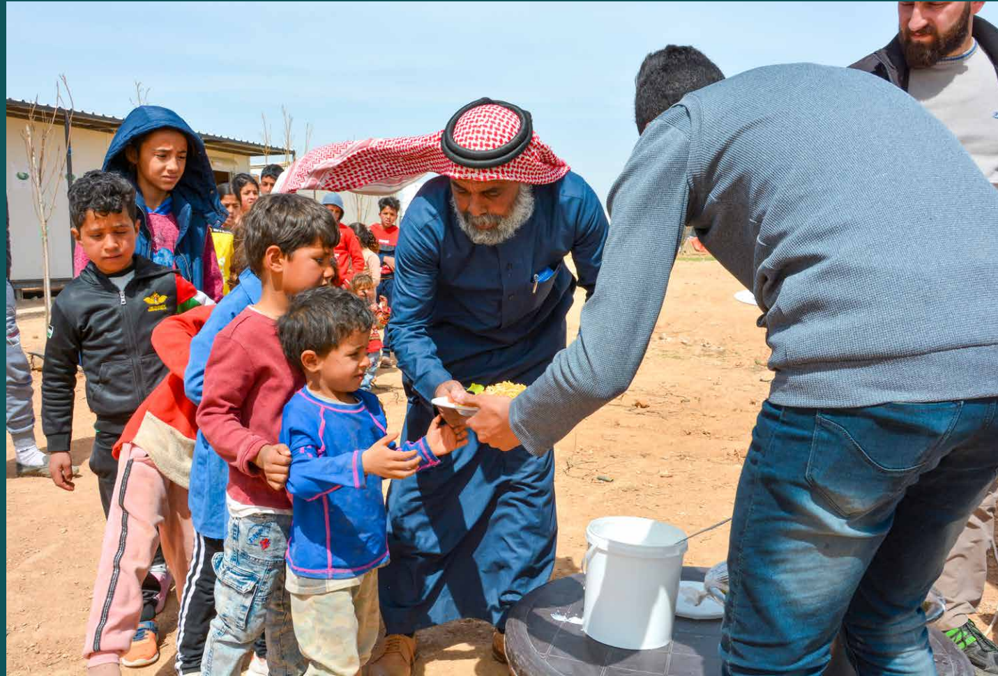
Indigenous missionaries serve warm meals to Syrian children in a refugee camp.