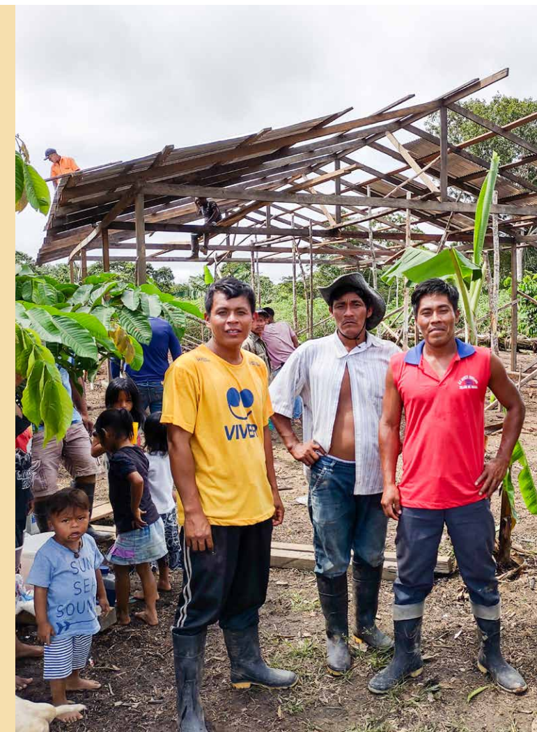
Alongside the gospel, income-generating projects bring dignity and hope.