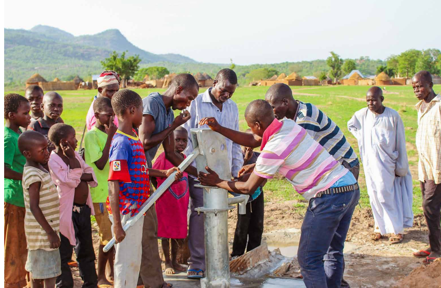
An indigenous ministry in Nigeria installs wells in poor communities—a powerfully effective way to open doors for the gospel.

“Funding from Christian Aid Mission has been a lifeline of hope and a tool for transformation,” the leader of a ministry in Nigeria said. “It has enabled us to proclaim the gospel, care for the suffering, and disciple the next generation of leaders across multiple regions. We thank you for your faithful partnership in advancing the Kingdom of God.”