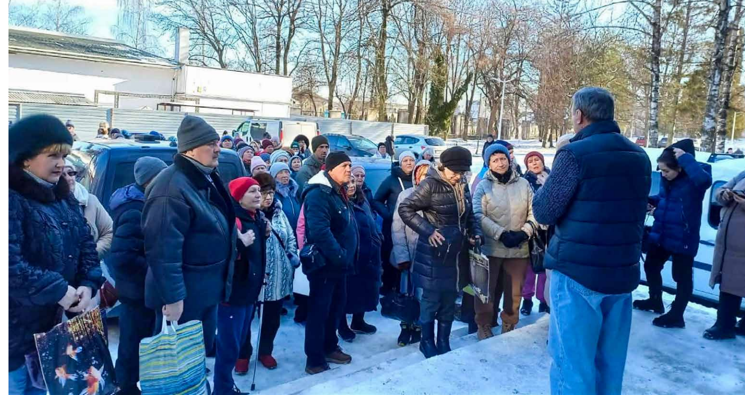
Ukrainian refugees are hearing the gospel for the first time through indigenous missionaries.