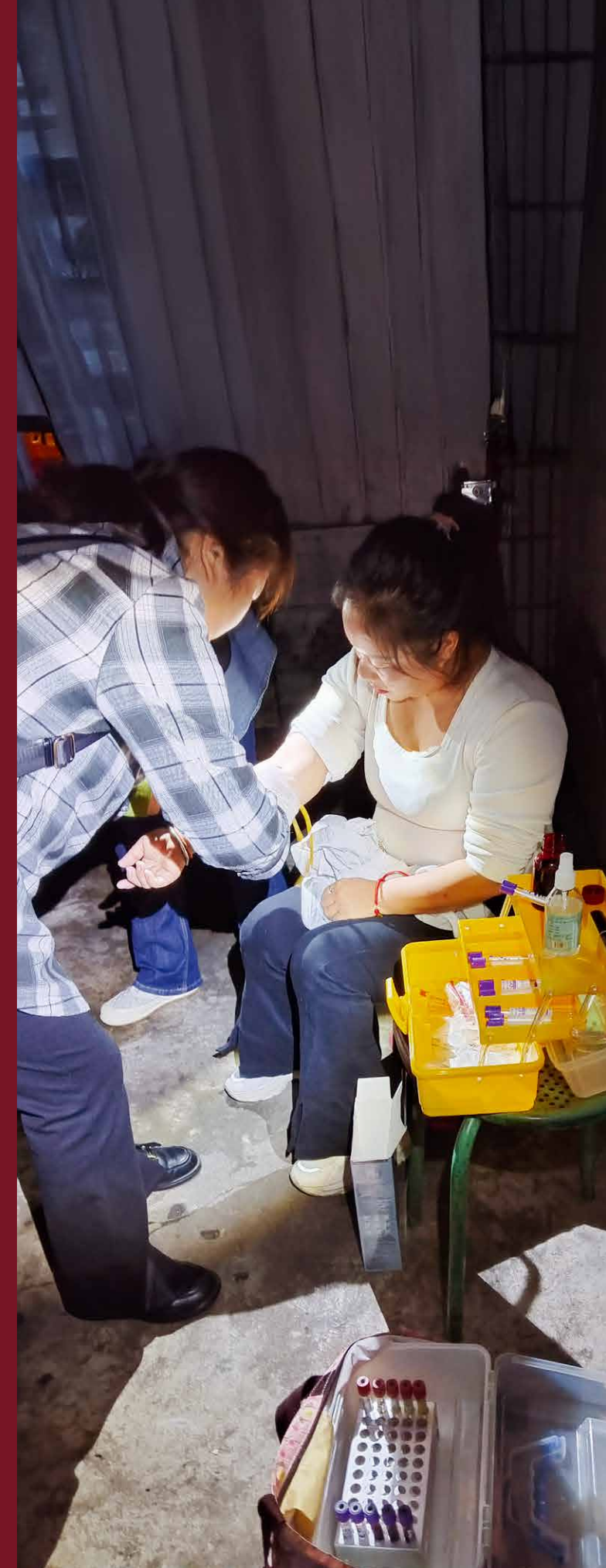
A missionary provides care for a woman in the red-light district.